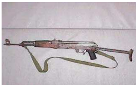
Rifle with device

6. High Rate-of-Fire Trigger Modifier: A weapon was recovered on 30 Jul 02 by members of the Cincinnati Police during execution of a drug related search warrant. An MAK-90, (AK-47 variant) rifle recovered was equipped with a "Hell-Fire Trigger System" (also marketed under the name of "Hell-Storm 2000"). This trigger attachment interferes with normal operation of a semi-automatic firearm by causing a "static" condition and allowing the bolt to repeatedly slam against the firing pin to simulate fully automatic gunfire. Depending on the type of firearm on which it is installed, it can produce a firing rate of approximately 10 to 15 rounds per second. The devices are marketed on the Internet through various websites including www.perfectgiftgetter.com (Cincinnati Police Intelligence Unit, (513) 564-2200).