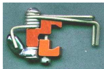
Close-up of device